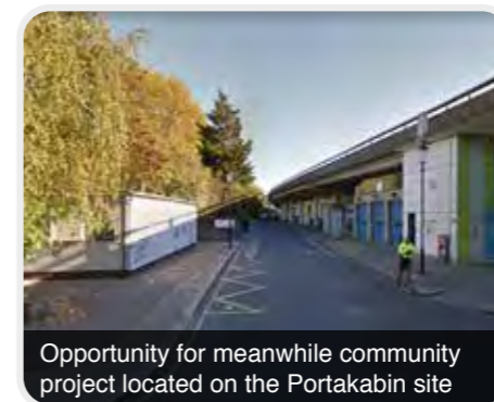
Opportunity for meanwhile community project located on the Portakabin site