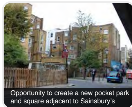
Opportunity to create a new pocket park and square adjacent to Sainsbury's