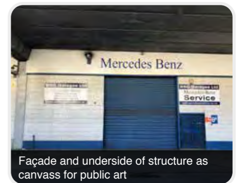
Façade and underside of structure as canvass for public art