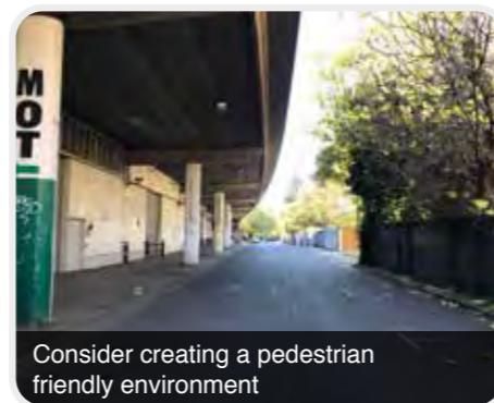
Consider creating a pedestrian friendly environment