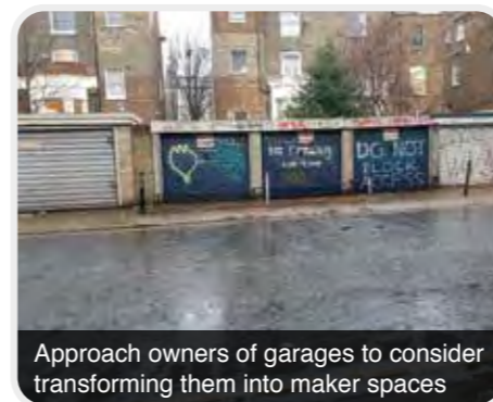
Approach owners of garages to consider transforming them into maker spaces