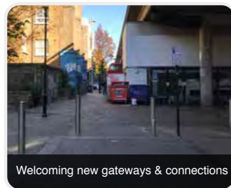
Welcoming new gateways & connections